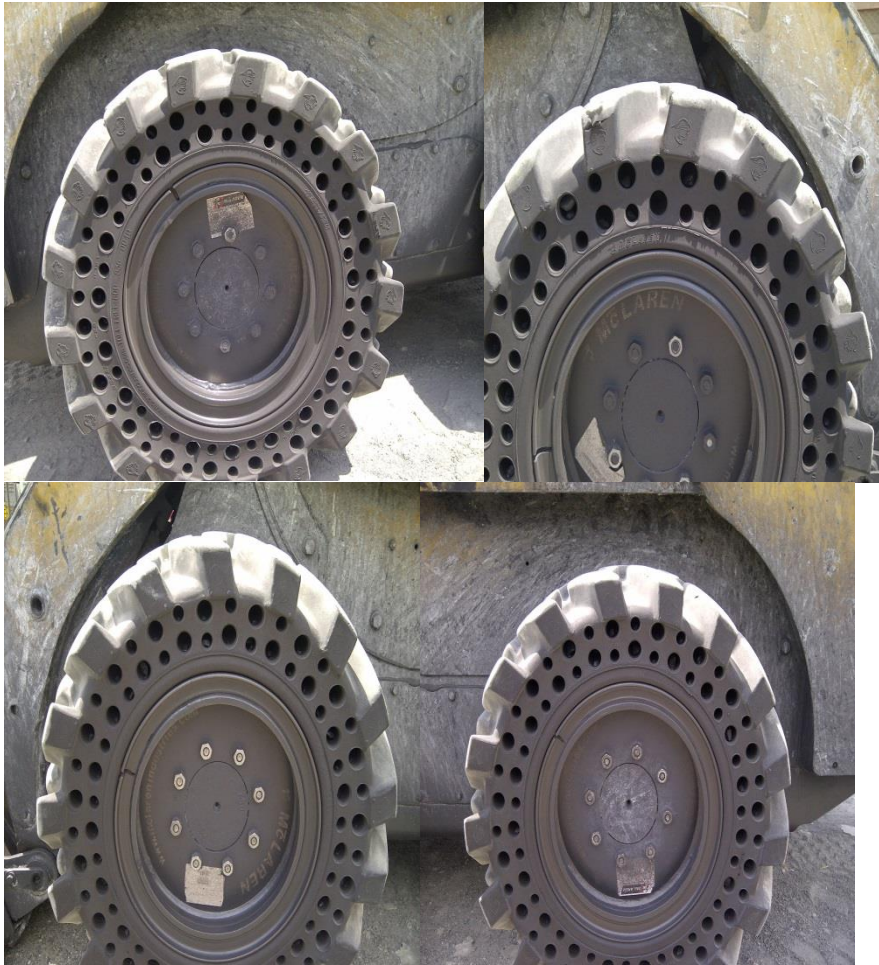
Pic 1 : Showing rear right tyre 46.00mm tread left